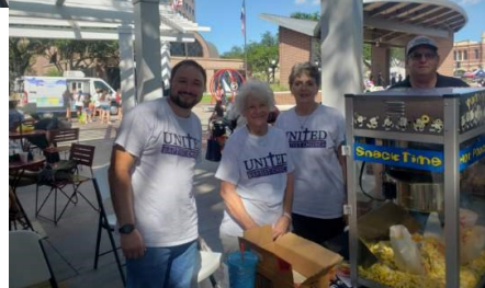
National Night Out Kickoff Party!